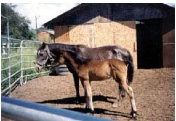
Pregnant Buttercup was rescued from a feedlot by TRACS and subsequently gave birth to a foal, Romeo.

Thanks to a generous grant from Vancouver Foundation, TRACS has launched a project designed to raise awareness about the plight of equines in our country and to promote the adoption of horses to good homes. According to Agriculture Canada, 112,887 horses were slaughtered in Canada in 2008. These animals arrived at one of seven federally-inspected slaughter plants from a variety of directions. Many were so-called "culls" from breeding operations (for instance, the quarter horse and thoroughbred racehorse industries) and many others arrived from private homes no longer able or willing to continue caring for their horses. Still others came from defunct trail riding businesses, rodeos, and from the PMU (Pregnant Mare Urine) industry, well-known for sending its unwanted foals and spent mares to auction and feedlots. Also in 2008, tens of thousands of horses arrived as imports for slaughter from the United States, where the last of the equine slaughter plants had been shut down in Illinois and Texas.