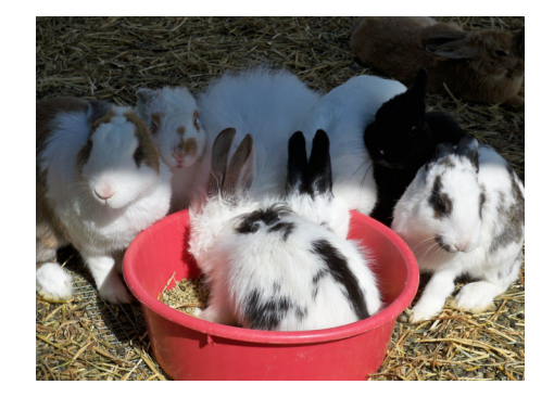
"And this is how you toss the salad"