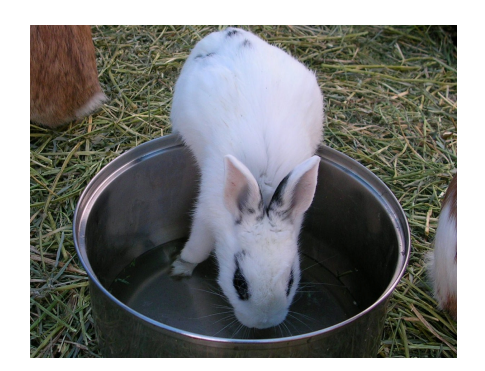
It isn't easy being short