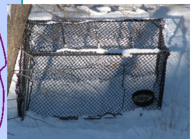
Clover Trap in DOI works yard