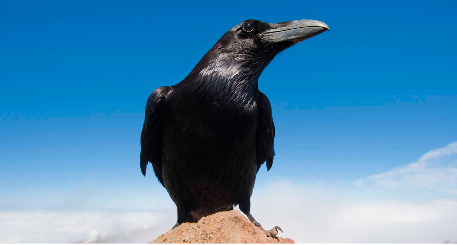
Common raven, La Palma, Canary Islands, Spain

of their behaviour demonstrate clearly that they are not surprising sampler of what we already know: machine-like automatons, but rather actively thinking and feeling beings. Donald Griffin, often called the "father of cognitive ethology", postulated that the ability of animals to adapt to unpredictably changing conditions indicated they were conscious and able to assess what needed to be done in a given situation. It's not a question of whether animals are conscious, but rather why consciousness has evolved and what it is good for.