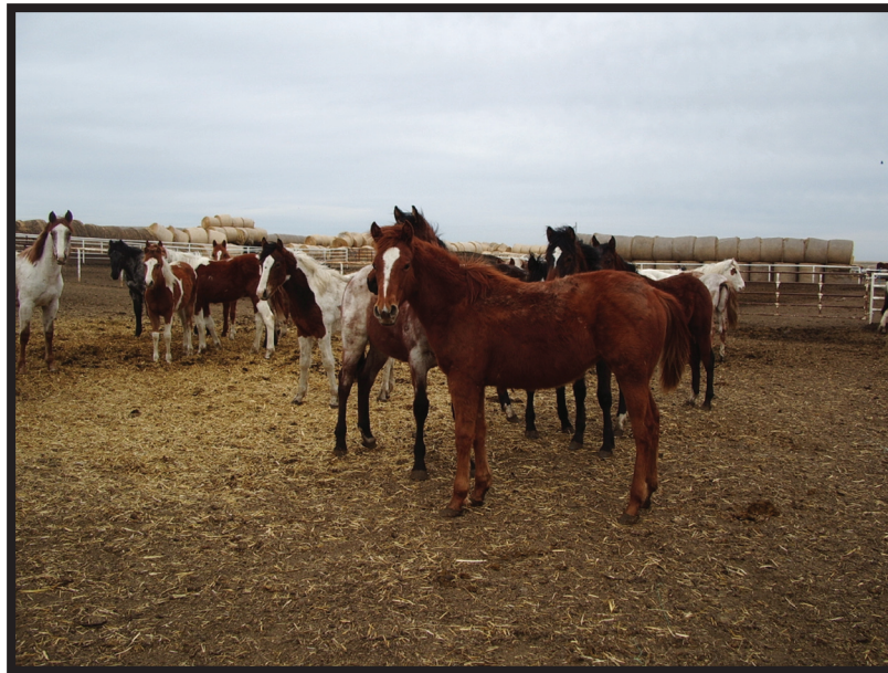
Horses and foals in a Canadian feedlot

Please help to keep the fund alive by donating generously to TRACS' Horse Protection Initiatives program! With Bill C-544 tabled and the possibility of an end to Canadian equine slaughter on the horizon, placement of horses into good homes and euthanasia of suffering animals will, as before, be priorities.