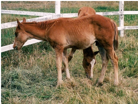
Jasper and Jasmine

Referred to as "crops" of foals, they are simply a commodity on many breeding and hobby farms as well as Pregnant Mare Urine (Premarkin) ranches. (1) Undesirable animals are culled and shipped to auction marts, where "killer" buyers swarm. Meat sales accept not only the old and the lame, but equines of all sizes, colours, ages, and breeds. It is not unusual to see even miniature horses and donkeys paraded about in auction rings. Frightened young foals, force-weaned and separated from their mothers at about three months of age or less, can be found at September auctions throughout Canada. Animal welfare violations abound. Although the Recommended Code of Practice governing PMU operations states that foals should not be weaned prior to three months old, the youngest "Premarkin" horse salvaged from a meat auction by TRACS was tiny six-week-old Jasper. His best friend, Jasmine, a filly of only eight weeks, was rescued as well. Another heart-rending example involved Angel, a three-month-old PMU foal who stumbled, shaking, into the auction ring and was quickly added to that year's already-overflowing quota of rescue cases. Marks resembling rope burns darkened her swollen neck; X-rays later confirmed a cervical fracture. Miraculously, Angel's broken neck healed and today she is happy, healthy, and pain-free. But we are left to wonder what violence she had to endure, possibly when being forcibly separated from her mother.