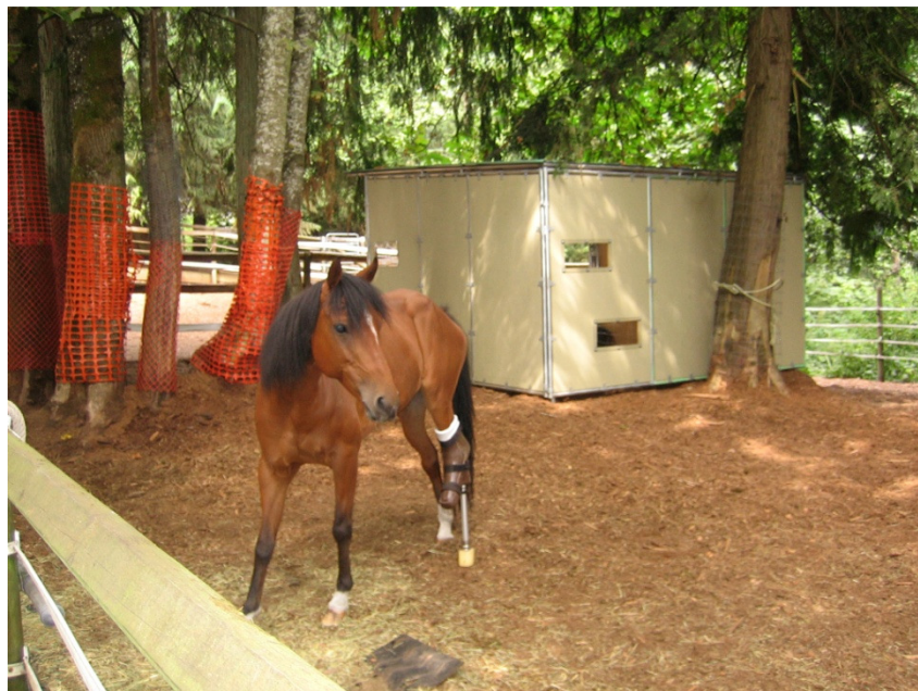
Sweet Nothing and her new shelter

Sept. 21, 2007—WASHINGTON, D.C. —“Today, The Humane Society of the United States (HSUS) hailed a decision by the United States Court of Appeals for the Seventh Circuit upholding the State of Illinois’ decision to ban the slaughter of horses for human consumption. Illinois is home to the last remaining horse slaughter plant in the country, and the ruling effectively ends all slaughter of horses for food in the United States” (HSUS press release). ~~~~~