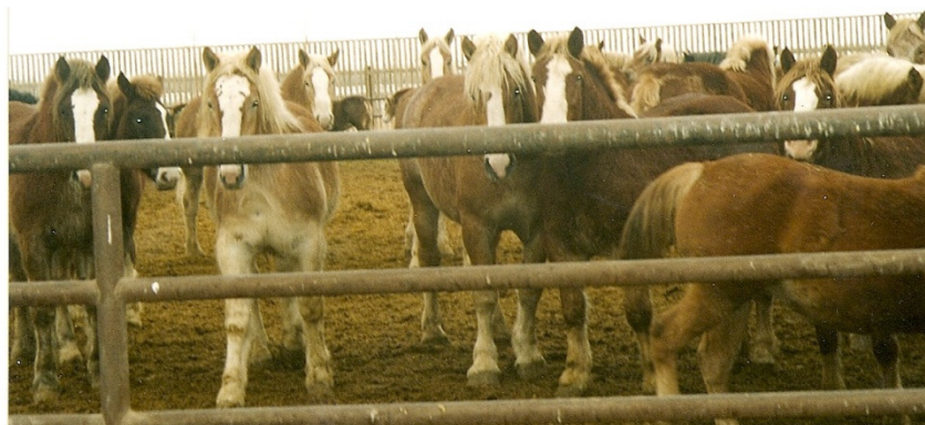
Horses awaiting slaughter in an Alberta feedlot

In the meantime, equines from the United States are crossing borders into Canada and Mexico, where many will join our nation's ill-fated horses in becoming slaughter and live export statistics. In anticipation of a lucrative market in horseflesh, Canadian equine abattoirs have now mushroomed to six: one in B.C. (Westwold), two in Alberta (Lacombe and Fort Macleod), one in Saskatchewan (Neudorf), and two in Quebec (Massueville and St. Andre-Avellin). Over 50,000 equine lives were lost to the horse slaughter industry in 2006, and we fully expect those numbers to be far higher as this year draws to a close.