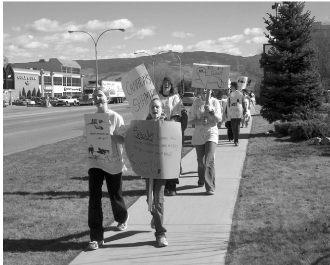
International Day of Action Against the Seal Hunt: Protest in Kelowna, B.C.

Prime Minister's Office Right Honourable Paul Martin Office of the Prime Minister 80 Wellington St. Ottawa, Ontario, Canada K1A 0A2 Fax: 613-941-6900 E-mail: pm@pm.gc.ca