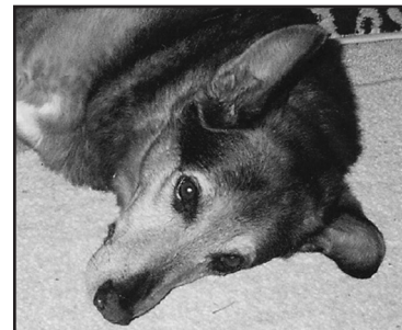
Cole Werts passed over Rainbow Bridge Nov./08 at 16+ years of age