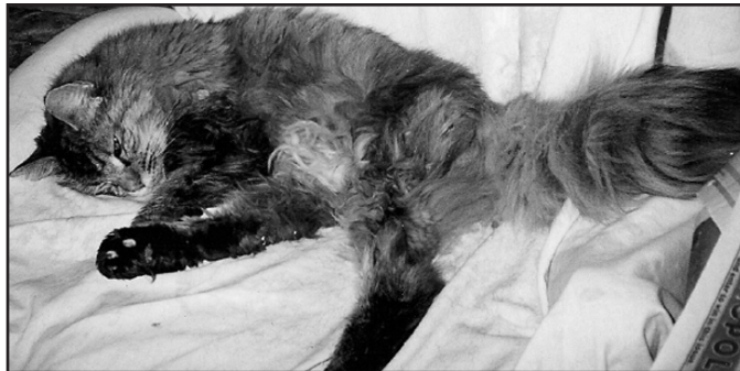
Dolly Werts gone Feb./08 just before her 20th birthday