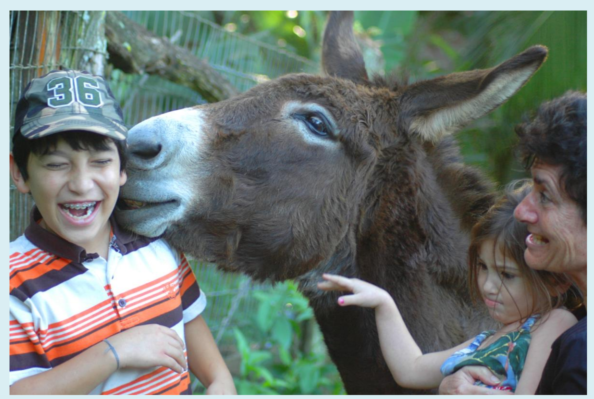
The farm animals are friendly and love visitors!

Sanctuary tours are offered every Wednesday at 4:00 p.m. and Saturday at 10:00 a.m. Reservations are required. For full details, click <a href="here">here</a>.