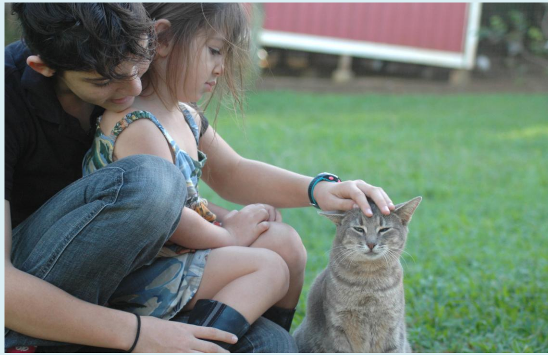
By learning empathy and respect for all life, children can become protectors of animals.