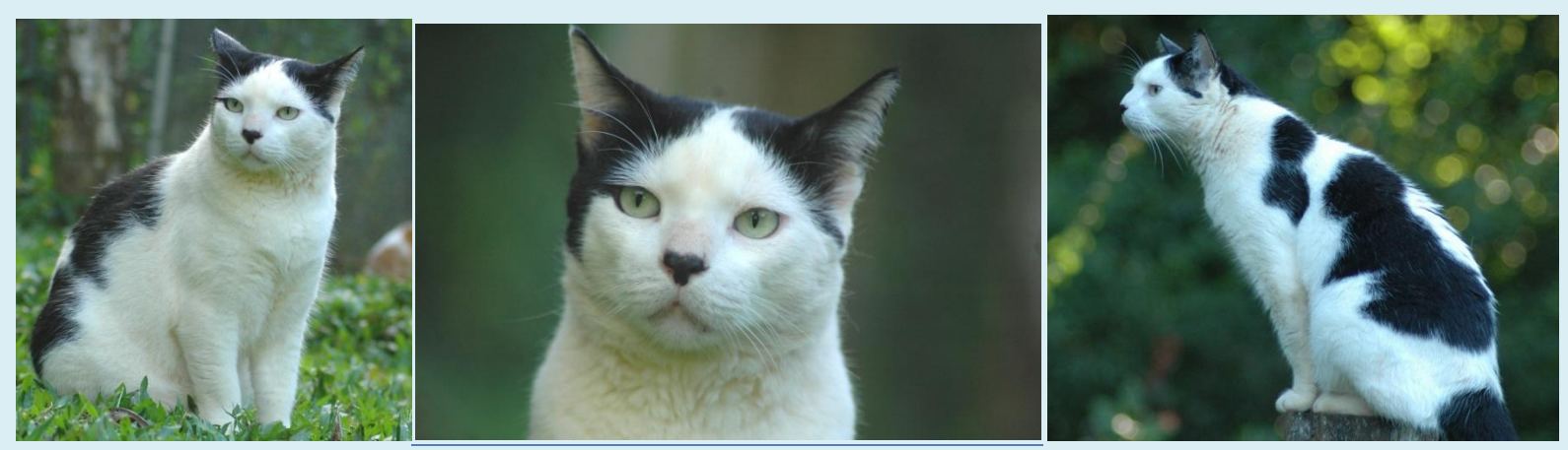
Li'i - missing his family, but receiving lots of love at Leilani Farm Sanctuary

Li'i, which means "little" in Hawaiian, was adopted as a tiny kitten by a family who loved him dearly and gave him excellent care, but they unfortunately lost their home and were not permitted to bring their beloved cat to the homeless shelter. Li'i is now living happily at Leilani Farm Sanctuary and still enjoys visits from his family.