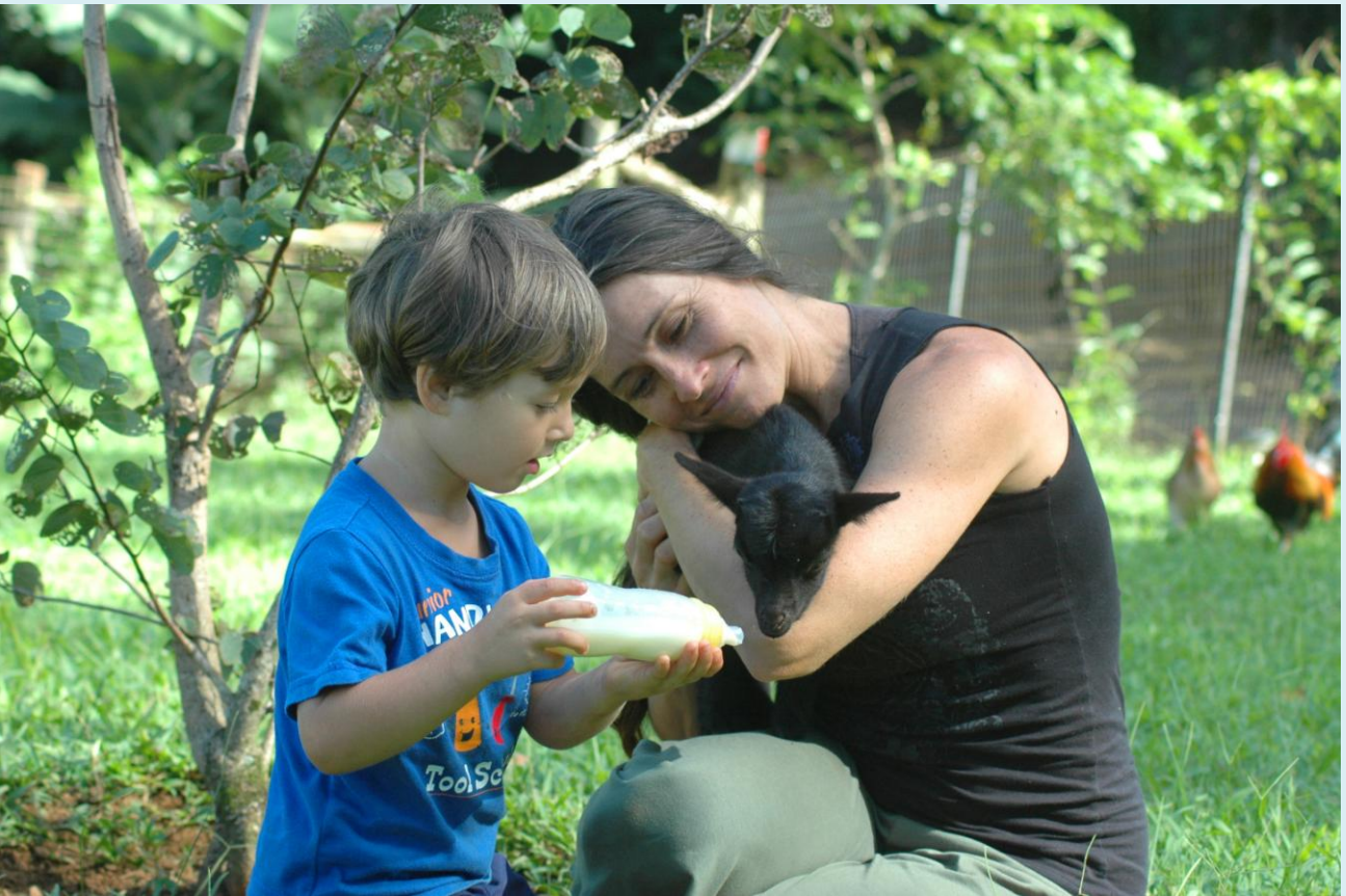
By learning empathy and respect for all life, children can become protectors of animals.