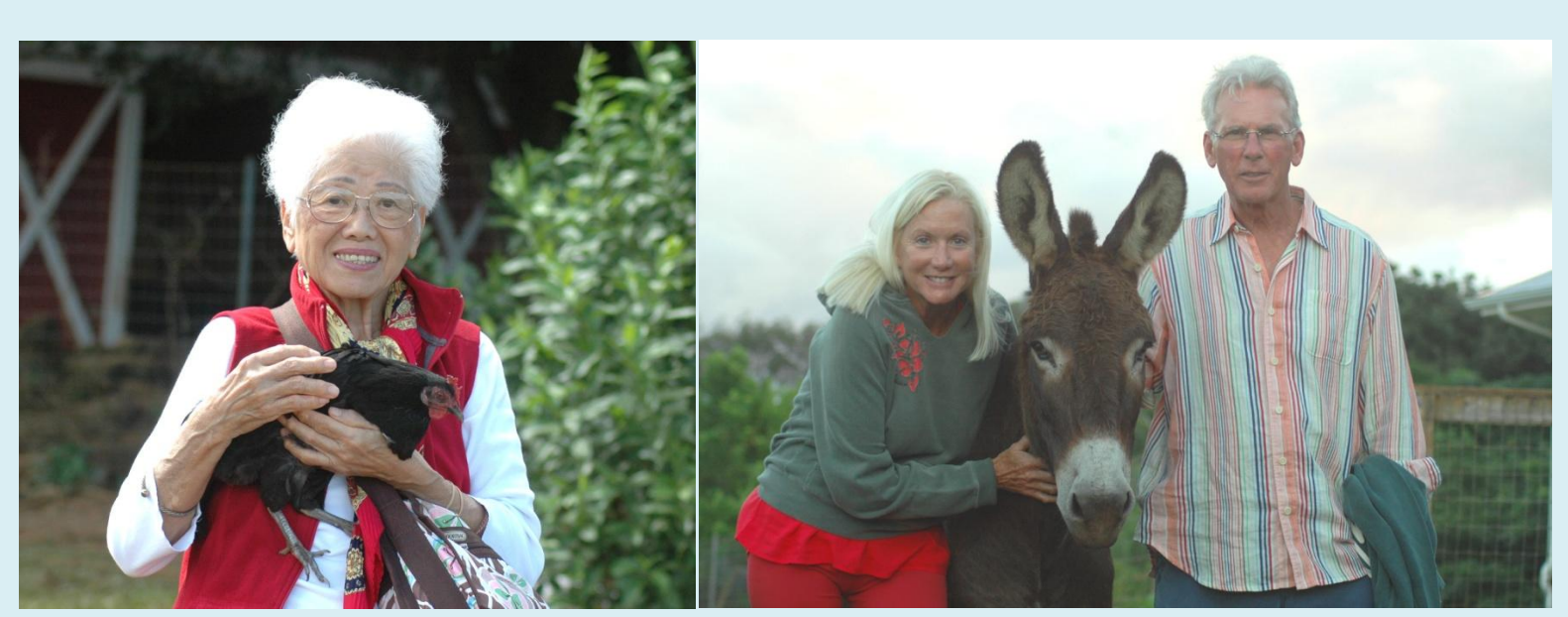
The farm animals are friendly and love visitors!

Sanctuary tours are offered every Wednesday at 4:00 p.m. and Saturday at 10:00 a.m. Reservations are required. For full details, click here.