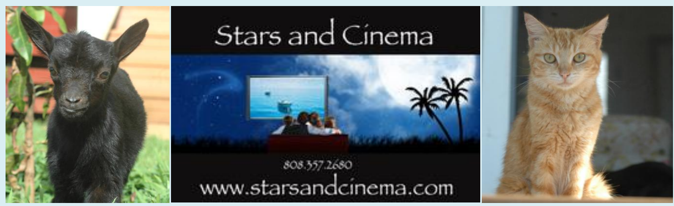
Produced by Stars and Cinema

http://www.youtube.com/watch?v=z-Q1kCD2DAA&feature=youtu.be