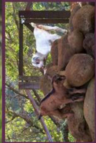
Freedom feels great!!