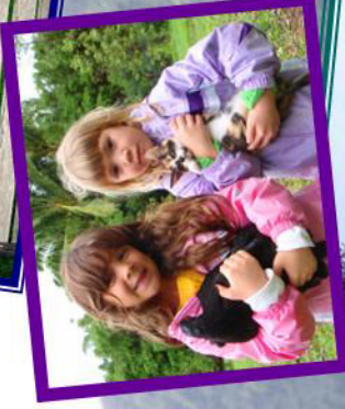
All our animals are well loved!!