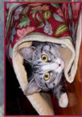
Possum came with all his litter-mates.