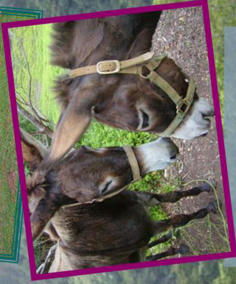
Donkeys need each other.