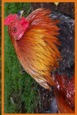
Richard the rooster escaped from a cock fighting prison.

Because Leilani Farm Sanctuary is a non-profit organization, to accomplish its goals, your support is needed. If you would like to volunteer, sponsor an animal or make a contribution, please contact us.