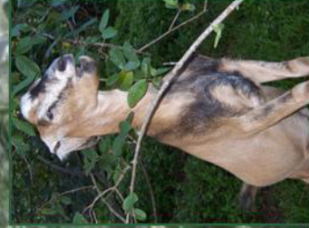
Johnny was saved from the butcher's knife.