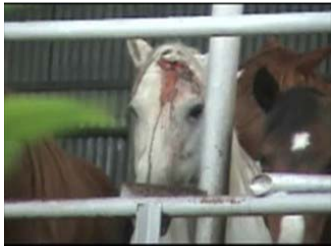
Horse with a severe head injury, at a Texas horse slaughter plant in 2005, possibly received on a double decker.