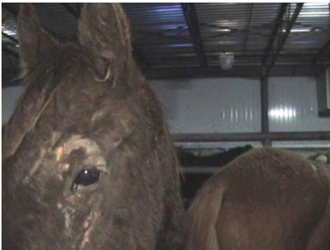
April 2008 - Horse with face lacerations at a Saskatchewan horse slaughter plant. It is common to see head injuries on horses that travel on double deckers.