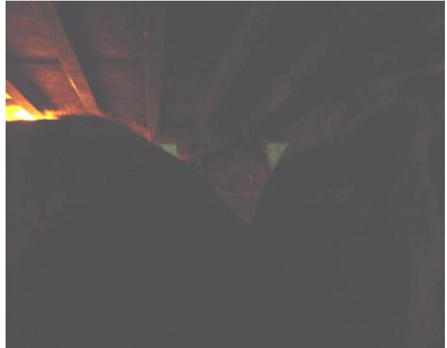
May 2009 - Picture taken at night into a double decker being loaded with horses. The horse on the left has very little clearance above the withers. Also notice the metal struts that further reduce headroom.