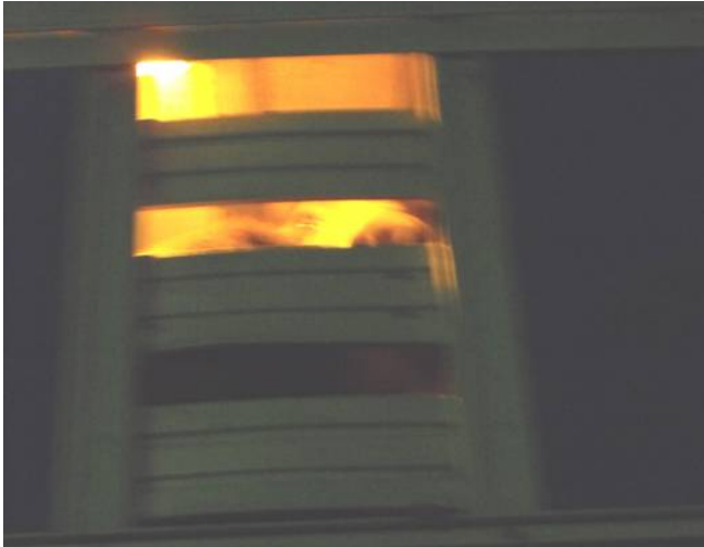
May 2009 - Horse on top deck of a double decker. She is in the back corner, pinned between the wall and another horse.