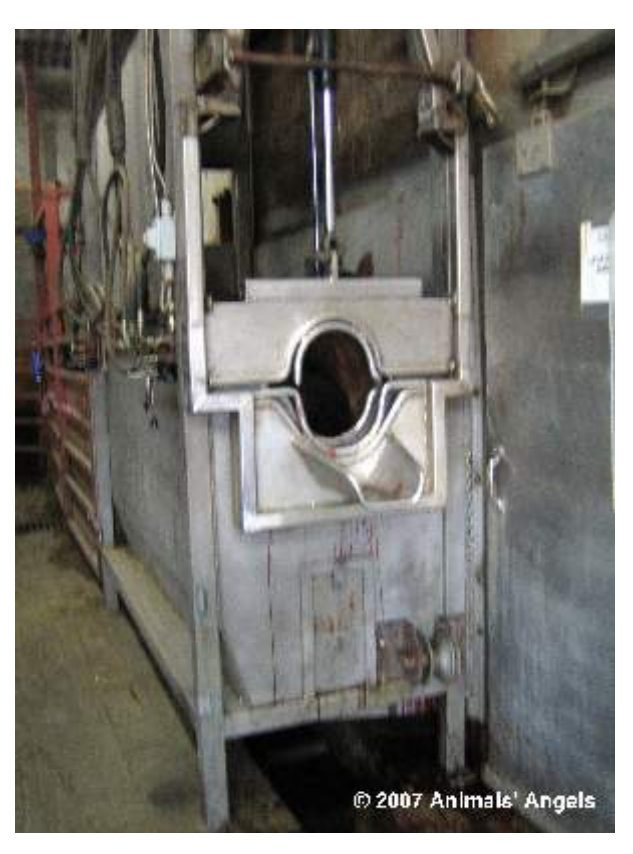
Blood-smeared kill box - horse left inside