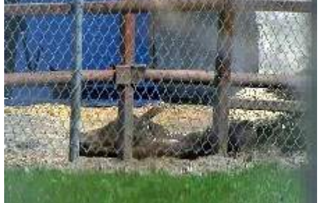
Close-up of horse on left