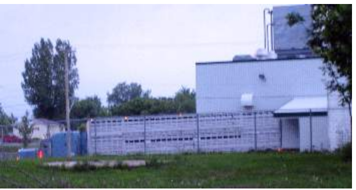
Roping J Ranch trailer unloading