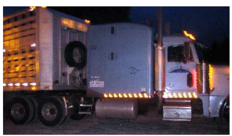
Roping J Ranch truck and trailer