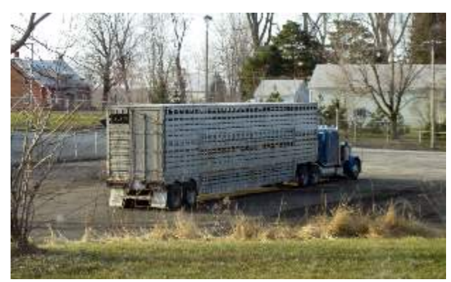
We later learned that two of these horses died shortly after their arrival. Their dead bodies were left in the rear parking lot.