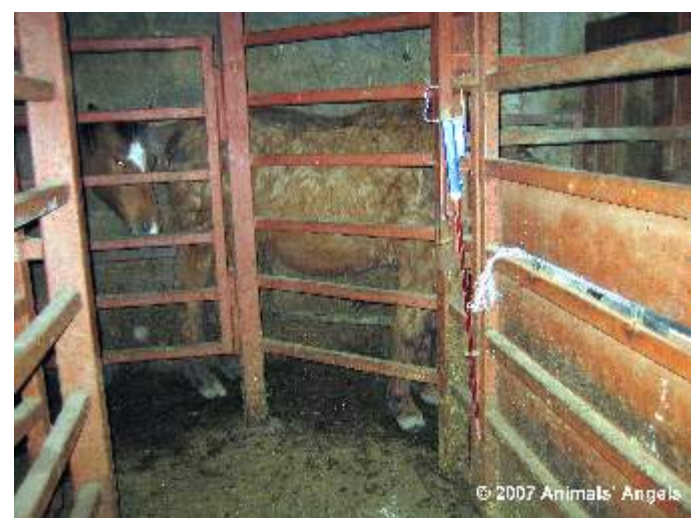
Note – electric prod used on horses (blue handle)

When asked why the two dead horses alongside the building had died, Mr Bouvry said the horses were "too lazy to walk to the water trough". He provided us with a tour, which included the kill floor. We were shocked to see horses left standing in the waiting pens and lined up solid in the single file kill chute leading to the kill pen as the workers went on lunch break. What shocked us even further though was that a horse was left standing in the kill pen, shaking with terror. The kill pen was smeared with blood and remains from the horses before him. It was clear that this horse and the ones left in the kill chute were extremely traumatized. Many were shaking so badly standing was difficult. This was exacerbated by the fact that many had broken limbs. The grey mare we had seen earlier was extremely emaciated. We were able to confirm that her rear leg was indeed broken. In fact, all horses were in very bad condition. We saw tumours, emaciation, broken limbs and strangles (which illogically had been sliced open – extremely unhygienic as the lumps are composed of thick, highly virulent pus).