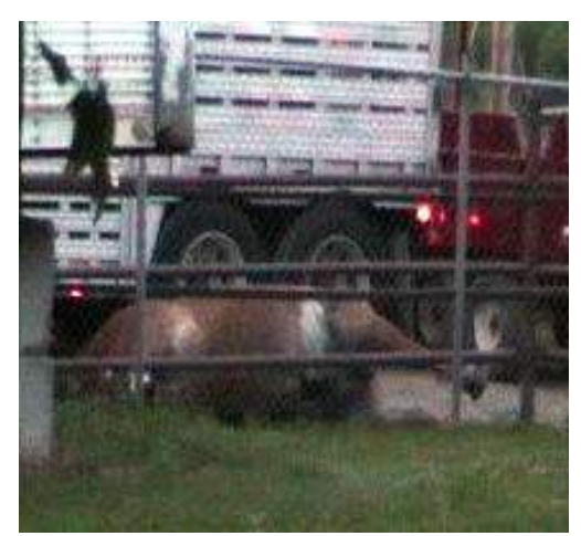
Deceased horse pulled off trailer and left in parking lot