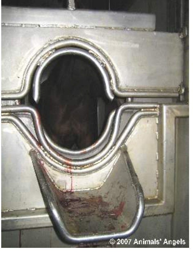
Horse left in blood-smeared kill pen while workers go on lunch break