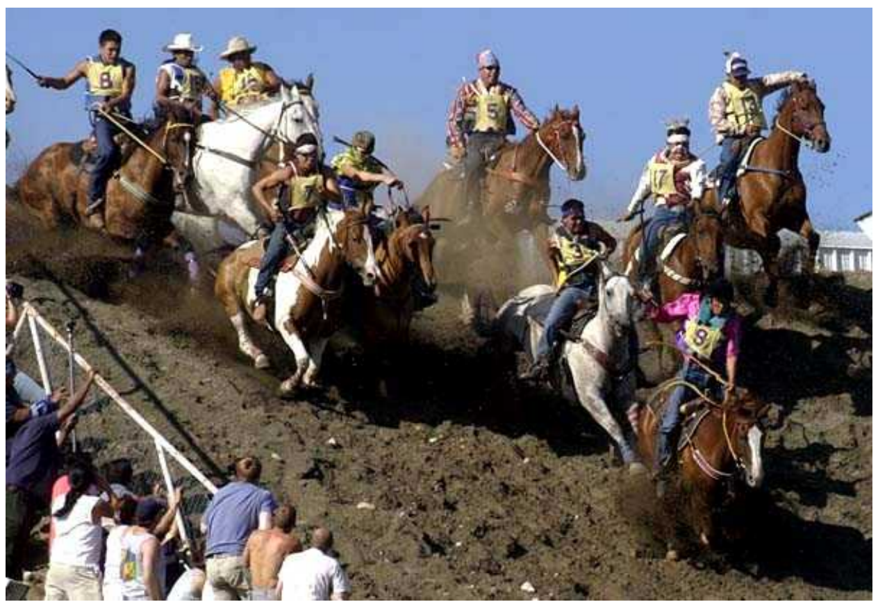
Over the hill Sunday.

Copyright 2003 Al Camp/The Omak Chronicle Horses fly over the lip of the World Famous Suicide Race Aug. 10, 2003, in the final race of four to determine the overall race winner Contact Al via his gallery, <a href="https://www.seeinglight.com">www.seeinglight.com</a>.