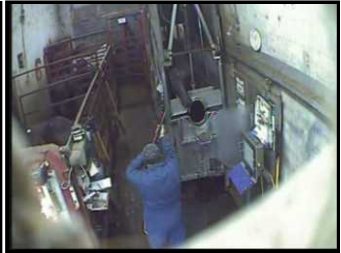
Horse 66 being shot a 2 nd time, can see impact of bullet on left side of forehead