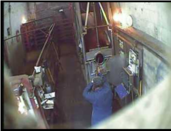
Horse 50 shot in right eye, remains standing