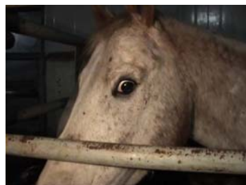
These images are of horses whose lives ended in the kill box at Natural Valley Farms, Saskatchewan